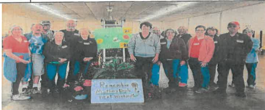
The Sandusky Ottawa county Master Gardeners at the annual plant sale Saturday, May 4, 2024